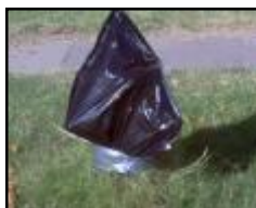
Inoperative fire hydrants were "bagged" during the flow testing program.

down when you see the crew to block the street for long; it is times. The more preventative do now will help postpone the pairs down the road.