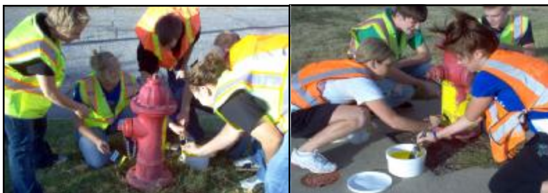
Wearing safety vests borrowed from EPW, 310 Leadership members and other volunteers made short work of painting the color codes on all the fire hydrants in town.

We will make a presentation on the color-coding project to the Ellis City Council at their regular meeting on December 5th. Our final class presentation will be on December 6th at 6:30pm in Stouffer Lounge on the 2nd floor in the Memorial Union. ttt